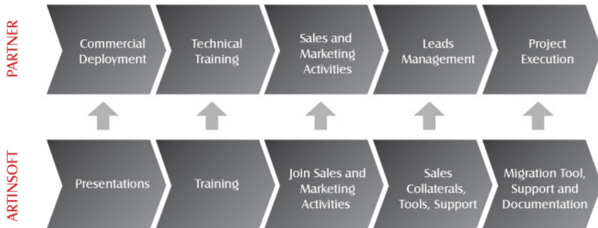
Figure 5 – Partner supported by ArtinSoft

As mentioned before, technical and pre-sales support, commercial deployment for your sales and presales teams, technical training for your center of excellence/development team, co-marketing programs, campaigns, sales collaterals and specialized documentation are available for partners. All benefits and obligations will be established in the partnership agreement, or seen on a case-by-case basis.