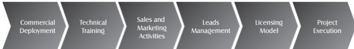
Figure 4 – How the Program Works

ArtinSoft Partner Program drives Partner success with top-of-the-line tools and support in the different stages of the software migration business. The main processes covered and supported by our program are: