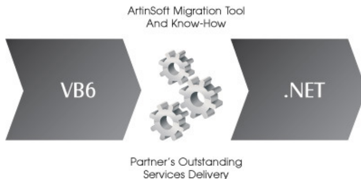
Figure 3 – Execution Model

Your organization will provide the services and solution to the customer. ArtinSoft will license the migration tool and provide support in the conversion process.